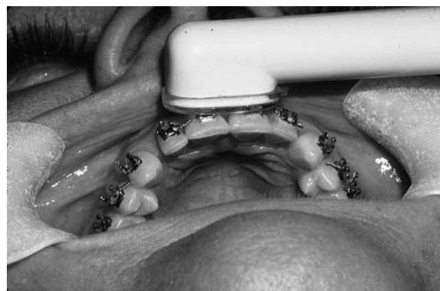
FIGURE 3. Using the new LED light, two brackets can be cured simultaneously.

The present findings indicated that the shear bond strength of the orthodontic adhesive obtained when using the LED light-curing device for 20 seconds was not significantly different from that obtained when the brackets were