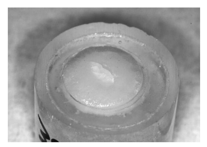
FIGURE 2. Surface destruction categorized as crack. Crack without defect can be recognized.