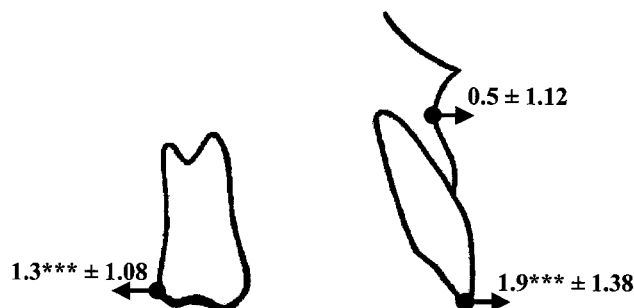
FIGURE 4. The frontal bite plane group (N = 20). Skeletal and dental mean changes (in mm) and standard deviations contributing to alterations in sagittal movements of incisors and molars in the maxilla. The average forward movement of the incisors was 1.4 mm (SD 1.16) and the mean distal molar movement within the maxilla was 1.8 mm (SD 1.02). * P < .05 ; ** P < .01 ; *** P < .001 .

In the NA group, the anchorage loss, ie, the average anterior movement within the maxilla of maxillary incisors and proclination of the incisors, was 1.9 mm and 3.3^\circ , respectively. The corresponding anchorage loss in the FBP group was 1.4 mm and 4.0^\circ (Figures 3 and 4; Table 1). The difference in anchorage loss between the groups was not significant (Table 1). The mean overjet was increased 1.2 mm in the NA and 0.4 mm in the FBP group. Significantly more proclination and anterior movement of the mandibular incisors was the reason for the smaller increase in overjet in the FBP group (Table 1).