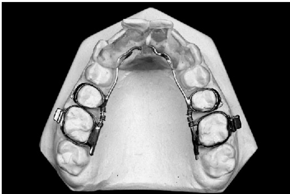
FIGURE 2. Occlusal view of the intra-arch Ni-Ti coil appliance provided with a fixed acrylic frontal bite plane as anchorage. Note that the bite plane was extended to the palatal vault to improve anchorage.

button provided anchorage. All appliances in the NA group were made by one orthodontic technician and efforts had been made to construct the Nance button with equal size and dimension for all patients.