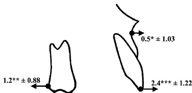
FIGURE 3. The Nance appliance group (N = 20). Skeletal and dental mean changes (in mm) and standard deviations contributing to alterations in sagittal movements of incisors and molars in the maxilla. The average forward movement of the incisors was 1.9 mm (SD 1.19) and the mean distal molar movement within the maxilla was 1.7 mm (SD 1.20). * P < .05 ; ** P < .01 ; *** P < .001 .