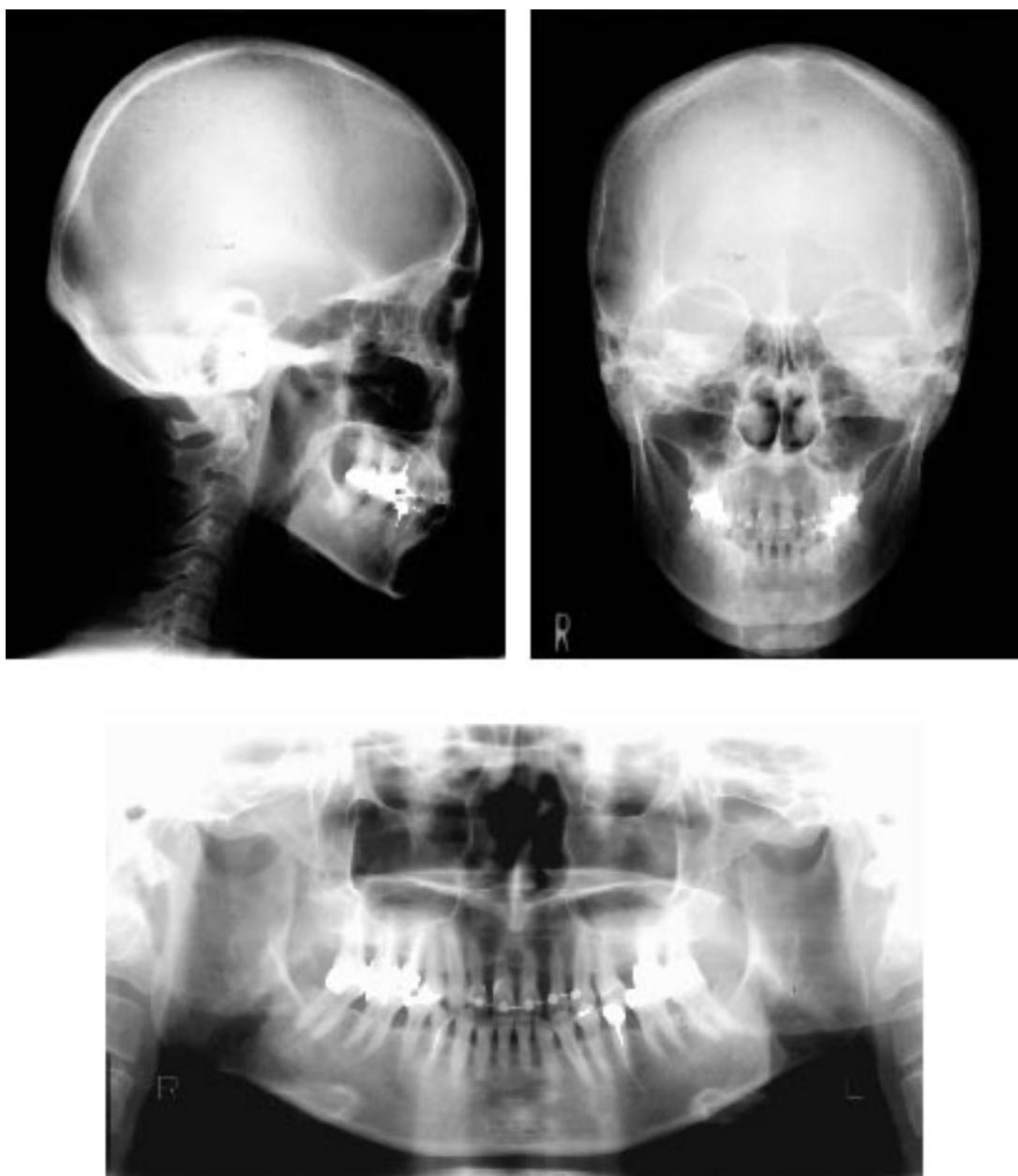
FIGURE 2. Pretreatment radiographs.

terior region as was a lateral anterior crossbite on the left (Figure 1). Spaces were present on the mesial and distal sides of the maxillary left first premolar because of the missing maxillary left second premolar. A lingual fixed wire bonded to the five maxillary anterior teeth was present. The mandibular anterior teeth were mildly crowded. The dentition showed generalized gingival recession but with no pockets greater than three mm and normal mobility. Radiographic examination revealed generalized moderate bone loss (Figure 2). No signs or symptoms of temporomandibular disorder were noted despite the occlusal dysfunction due to the missing maxillary left second premolar.