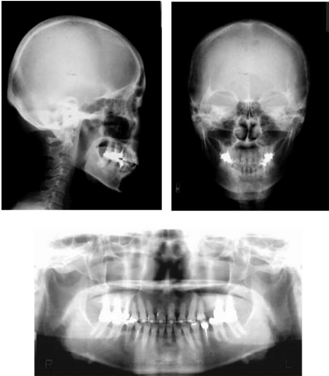
FIGURE 5. Posttreatment radiographs.

Periodontal treatment and the patient's cooperation in oral hygiene were also continued as supportive therapy. Previous reports have demonstrated that, with adequate plaque control, teeth with reduced periodontal support can undergo successful tooth movement without compromising their periodontal situation. 14-16