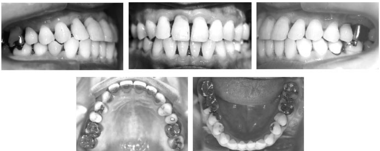
FIGURE 7. Postretention intraoral photographs, age 60 years two months.