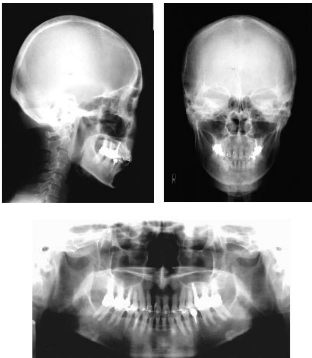
FIGURE 8. Postretention radiographs.

teeth and to create favorable conditions for oral function and hygiene maintenance.