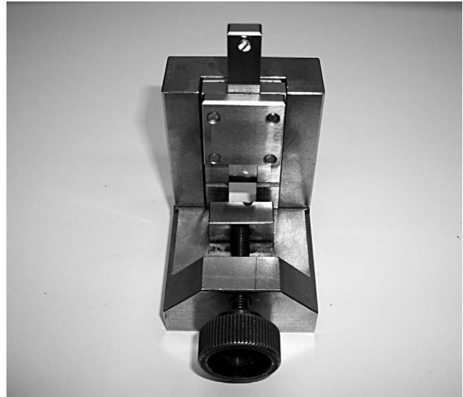
Figure 1. Overall view of the shearing rod used for performing shear bond strength tests.

A total of 60 recently extracted third molars were stored in 0.5% chloramines-T. The roots were removed and the crowns were embedded in autopolymerization acrylic resin so that the facial surface of each tooth was parallel to the base of the polymer. The teeth were cleaned with a nonfluoridated pumice