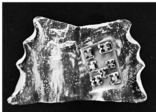
Figure 1. The appliance used.

Thus, this study investigated the ion release associated with the biodegradation process of three brands of metallic brackets manufactured with different types of steel and techniques. The immersion mean was in the oral environment, thus yielding similar results as those occurring during routine orthodontic treatment.