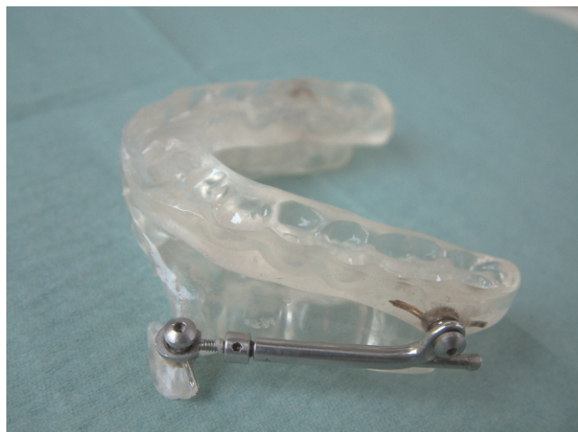
Figure 2. Acrylic breakage on the lateral telescopic attachment.

We observed that MAD breakages, mainly on the lateral telescopic attachment, were the most frequent reason for seeking an unscheduled visit to the dentist. Such complications could be explained by errors made by the technician, maladjustments made by the dentist, and functional overload caused by nocturnal bruxism. These complications not only led to discontinuation of the use of MAD in two patients but also increased the cost of treatment and delayed effective treatment for OSA. Therefore, technicians and dentists should make the maximum effort to give patients the most comfortable and robust appliance. Although many studies have been published about the efficacy and side effects of MAD therapy, only a few reports have dealt with technical failure and the maintenance costs of these devices. 4,11,18,20–22 In a previous study, 60% of subjects had experienced Herbst breakage and 40% received a replacement appliance after 3.6 years of treatment. 11 When a monoblock MAD was used, technical complications were reported infrequently during the first year of treatment. 18 However, six of nineteen patients had their monoblock device replaced by a new one in a 5-year follow-up study. 20 Monoblock devices could be more robust and cost effective, but an adjustable appliance allows the mandible to be protruded incrementally and permits a degree of side-to-side, protrusion, and opening movement of the mandible.