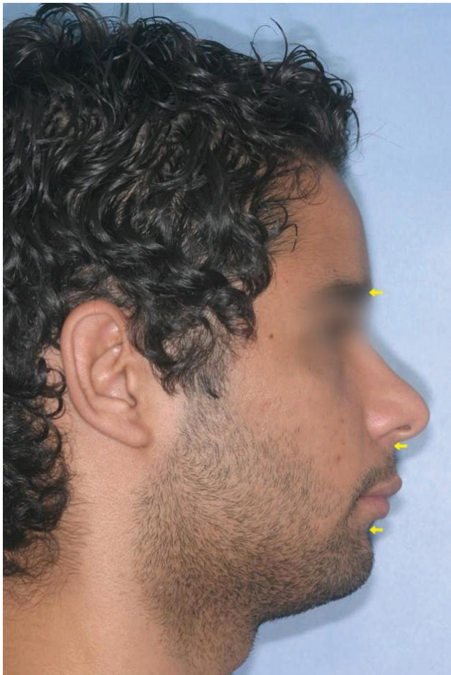
Figure 3. Photographs of a patient classified as pattern II. The arrows show the positions of the craniometric points of the glabella, subnasale, and menton. The convex profile is evident from the anterior position of the subnasale for the other two points.

takes into consideration the skeletal facial growth of patients, other than the Angle classification, which is based on the dental relationship. 19