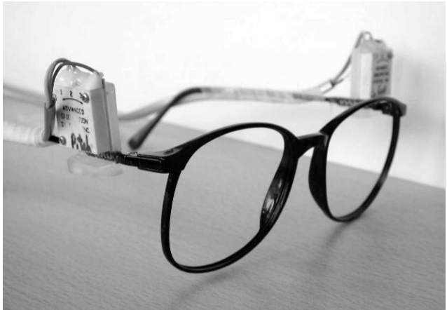
Figure 2. Cranial portion of device. Note placement of inclinometers on opposite sides.