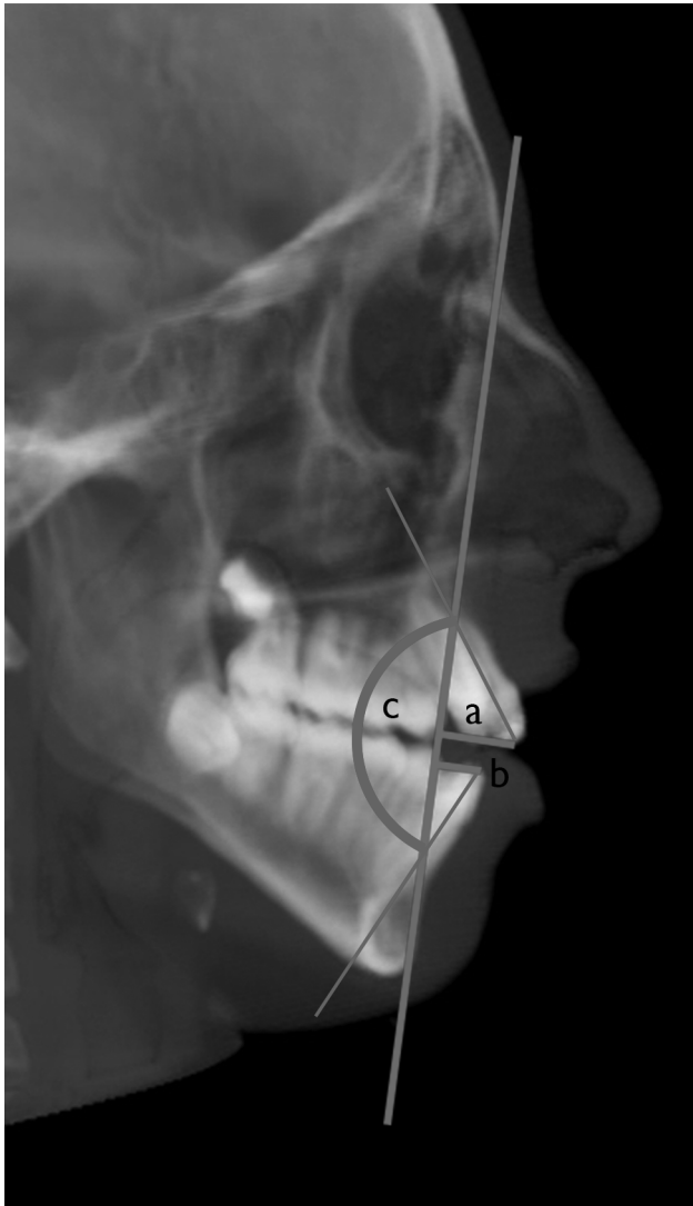
Figure 1. CBCT showing measures for (a) overjet, (b) overbite, and (c) interincisor inclination.

a laptop computer. Articulation evaluated different tongue movements, ie, single tongue, double tongue, triple tongue, and flutter tongue, using four exercises (A, B, C, and D). Range was measured by determining the maximum number of semitones over the note C5 that could be reached. Endurance was determined by timing the maximum continuous play while keeping the notes above a specific sound level. Sound level was controlled using a decibel meter (RadioShack Sound Level Meter: Radio Shack Corporation; Fort Worth, Tex) placed 19 inches from the bell of the trumpet. A few students could not perform all tests, resulting in lower numbers for some tests. An experienced music teacher-investigator evaluated all performances.