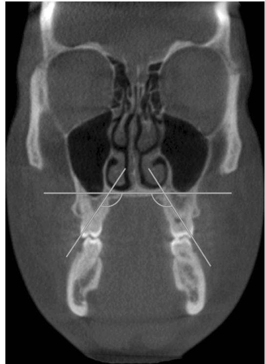
Figure 2. CBCT showing measures for molar inclinations.

A three-dimensional cone-beam computerized tomography scan (3D CBCT) was taken of each student the same day as the skills test. Since the 3D CBCT was available for another part of the study and the CBCT also