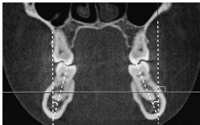
Figure 1. CBCT showing coronal section of mandibular first molars.

reported that both maxillary and mandibular molars upright with age while intermolar widths increase. 9,10