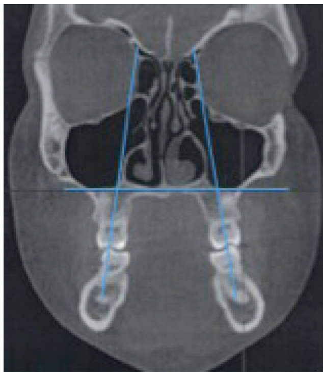
Figure 1. The upper angle formed by the intersection of the maxillary right and left first molar tooth axes.

furcation of the anatomic crown. The angles at which the right and left first molar tooth axes intersected were measured (Figures 1 and 2), which represented the inclination of both left and right molars.