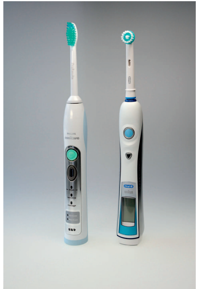
Figure 1. (a) Sonic brush (left). (b) Oscillating-rotating brush (right).

Subjects were screened before study entry, and their medical and dental history were reviewed. To participate, subjects were required to be at least 12 years of age, in good general health, have fixed orthodontic appliances on both arches, and have at least eight natural anterior teeth with facial scorable surfaces. Subjects were instructed not to use non-study oral care products during the study, other than their usual toothbrush and a regular fluoridated dentifrice during the 24-hour washout period between each visit. In addition, subjects were required to agree to abstain from performing any oral hygiene procedures after their evening brushing (not later than 11 PM) prior to the day of their scheduled study visit and to abstain from eating, drinking (except sips of water), smoking, and chewing gum for 4 hours before a study visit. Subjects could not participate in any other dental